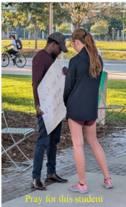
Pray for this student