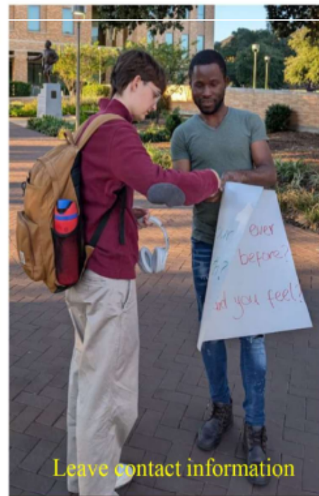
Leave contact information